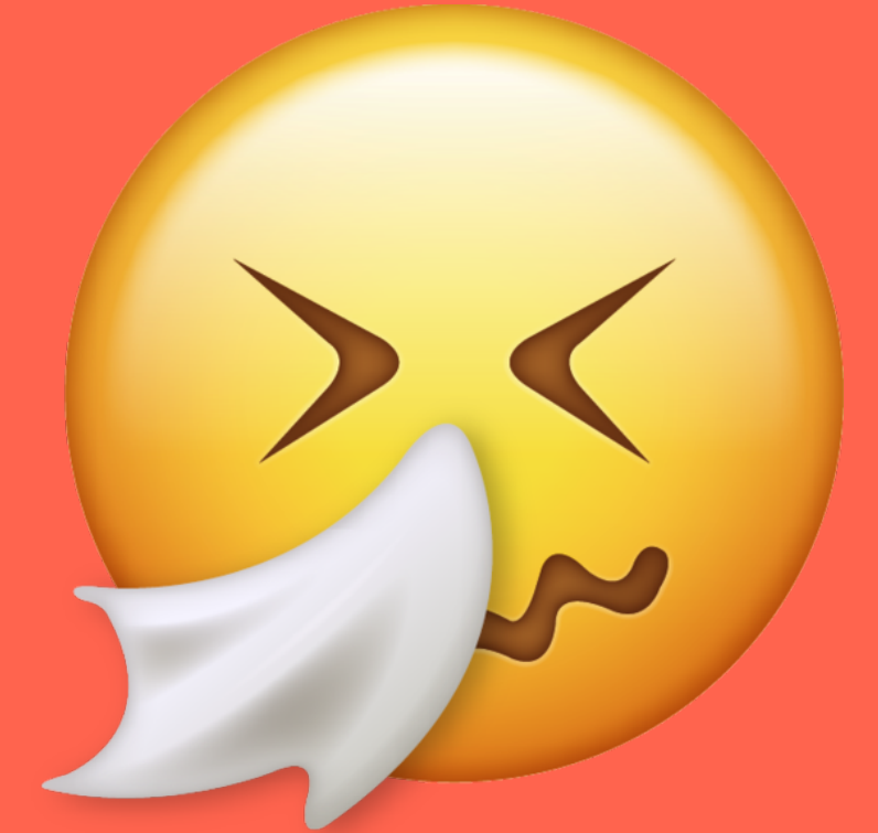
RUNNY NOSE GREEN OR YELLOW