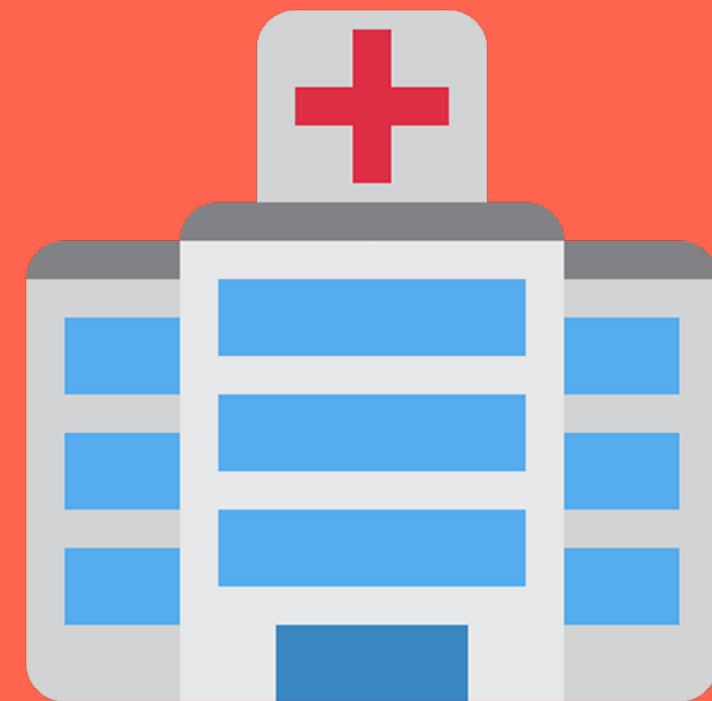
ER / DR VISIT FOR ILLNESS