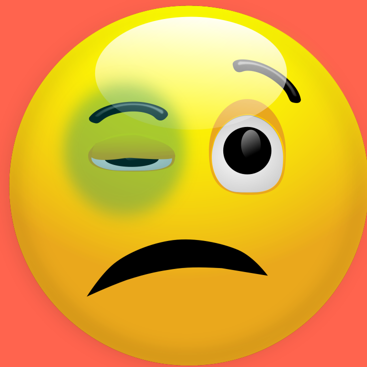
RED/ITCHY/ CRUSTY EYES